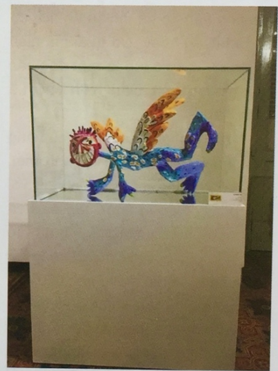
Tô-he 9. 2011. 80x90x40cm. Domino Art Fair, Tp.HCM