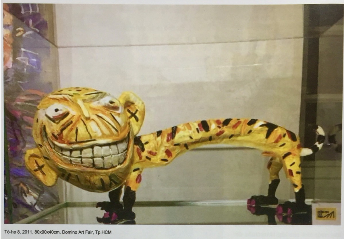
Tô-he 8. 2011. 80x90x40cm. Domino Art Fair, Tp.HCM