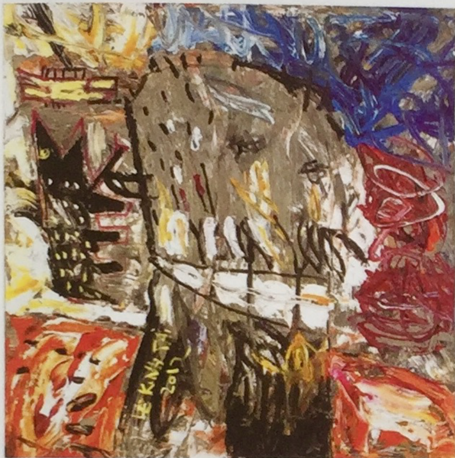
"Tự họa". 2012. Sơn dầu. 100x100. Hội chợ Tết-Art, Hà Nội

Last autumn, at the Autumn-Autum exhibition in Creative city, Hanoi, I had the opportunity to enjoy his large-sized new paintings and could not help but admire an abundance of creativity. Somehow, there was a feeling that those canvas, even so big, were still too narrow for him to paint and express freely.