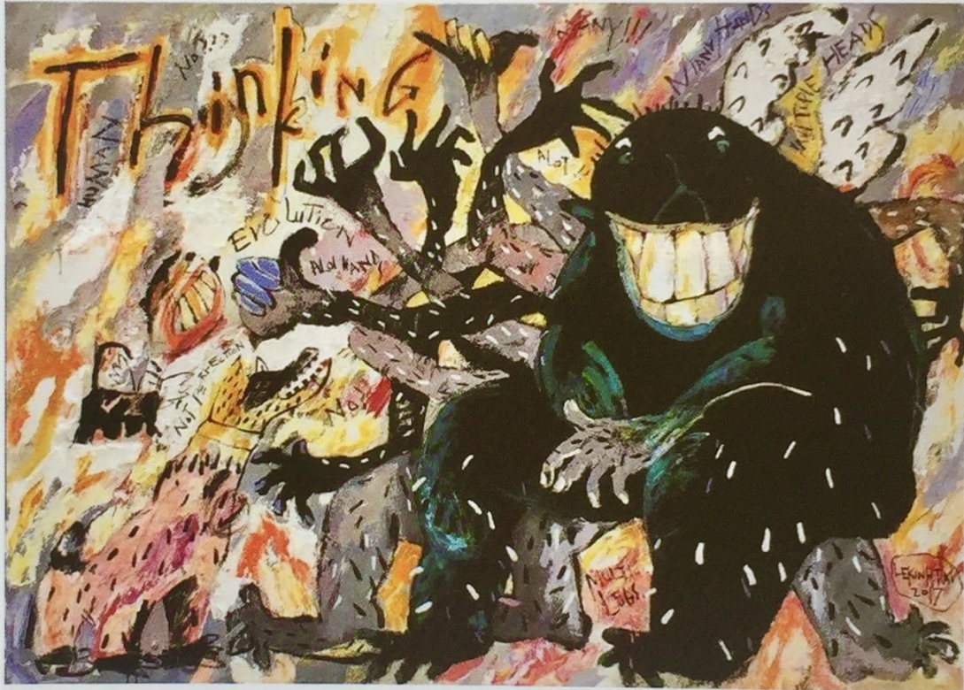
Human Evolution (Sự tiến hóa của loài người). 2017. Sơn dầu, 215x300cm. Domino Art Fair, Tp. HCM.

Two of his oil paintings in that 'Tet – Art', were quite small, each surface was just over a meter, but with a powerful brush style, bright color palette, it was enough to create a strong suction angle in vast space over 800 m 2 of the exhibition. On that occasion, I also fortunately attended the artist's art-talk, thereby, I understood that behind his innocent shapes, powerful brush style, bright color palette were stories of grim life and his thorny living philosophy, resilience.